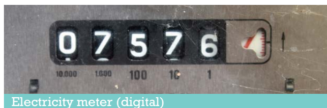
Electricity meter (digital)