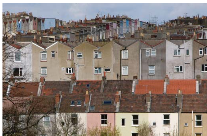
Solid-wall insulation can improve the warmth and thermal comfort of older homes in both urban and rural areas

These are estimated figures based on a gas-heated, three-bed semi, and are for the whole installation . If you are using a more expensive heating fuel, e.g. oil, the savings will be higher, and if you are only insulating one or two walls (e.g. if your house is in a terrace) the installation costs will be lower